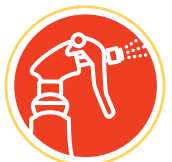
Pesticide & Herbicides