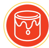
Cans of Paint