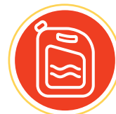
Pool & Garden Chemicals